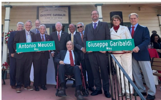
OSDLA members, national officers and GMM Board members pose for a photo with street signs for Antonio Meucci Way and Giuseppe Garibaldi Way.