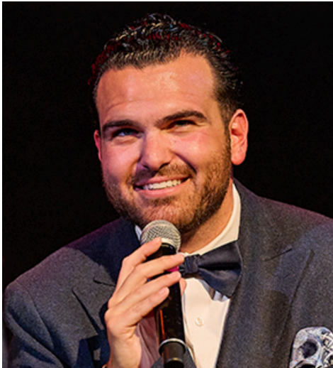
Sal "The Voice" Valentinetti