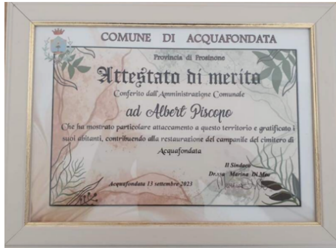
A photo of the Certificate of Merit from the Comune di Acquafondata.

Do you have a story about your Italian roots? We want to hear them! Click the button below to access our submission form for OSDIA members.