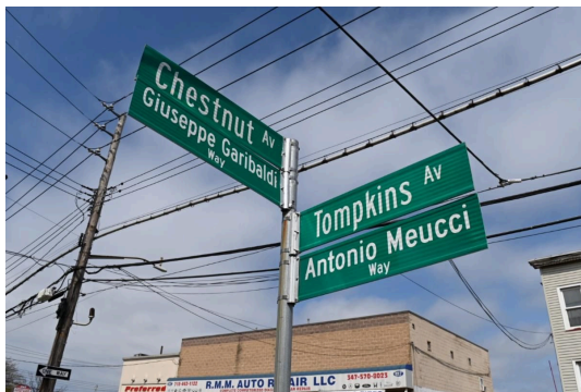
The newly co-named street signs for Giuseppe Garibaldi Way and Antonio Meucci Way.