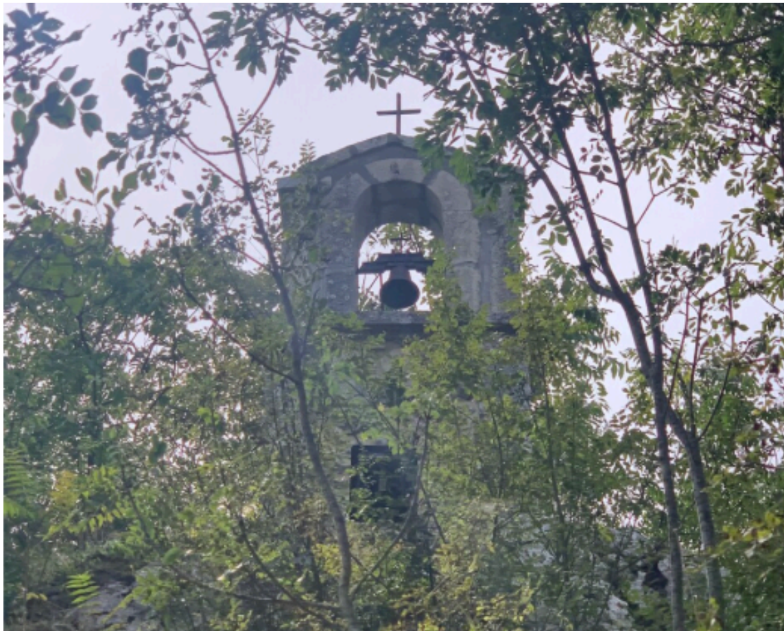
The restored bell tower in Acquafondata.

📍 Comune di Acquafondata Region of Lazio – Province of Frosinone