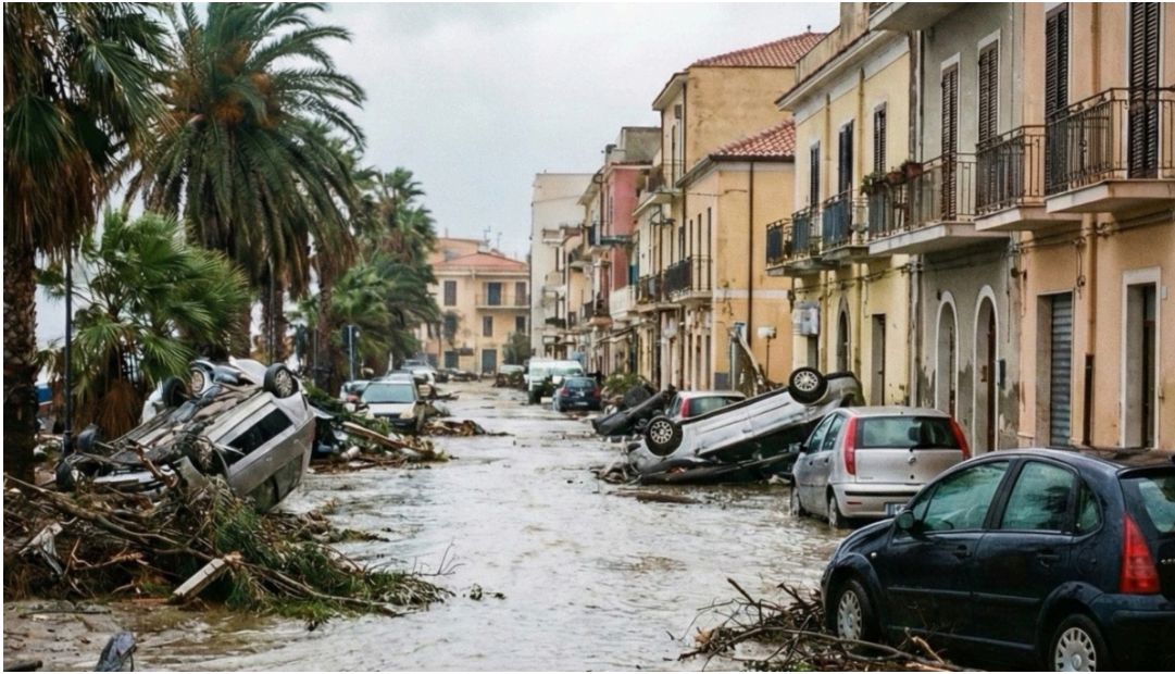
A community in Southern Italy in the aftermath of Cyclone Harry.

The Sons of Italy Foundation (SIF) is continuing to raise critical funds to support our Italian brothers and sisters in the aftermath of Cyclone Harry, which has caused devastating destruction across Southern Italy, Sicily, and Sardinia.