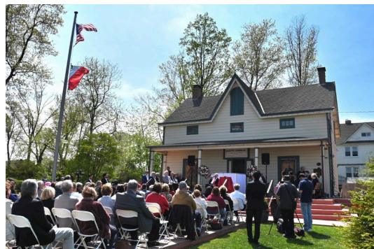
Guests during the GMM street dedication ceremony.