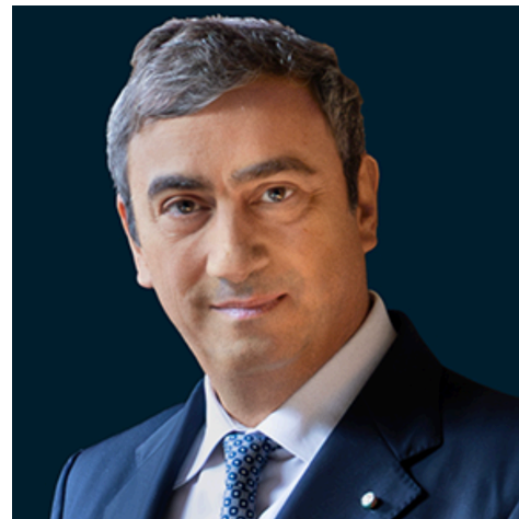
Marco Peronaci Ambassador of Italy to the United States